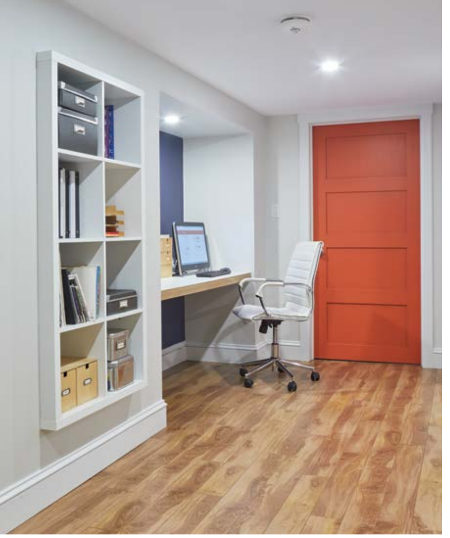
TOP: The lower level echoes the comfy, family-friendly theme for the renovations with ample seating for family and friends. LEFT: There's a place to play music, and even a hideaway nook where kids can read and dream. ABOVE: Kids can hang out while parents catch up on emails and plan projects in this organized home office space.