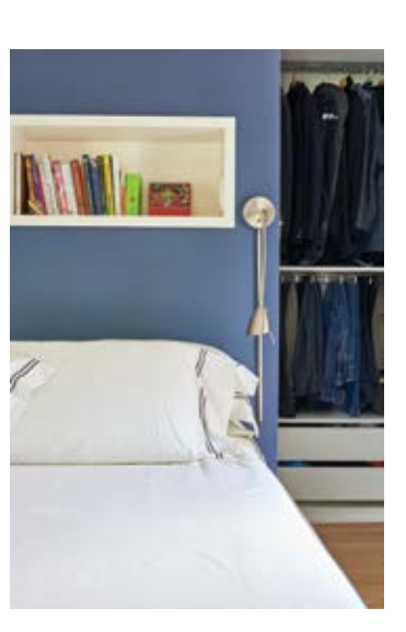
TOP: The master bedroom is a result of Jane's clever design work and practical use of space. ABOVE LEFT: The open-concept en suite is soothing yet funky with a mixture of modern cabinetry and vintage blackand-white floor tiles. ABOVE RIGHT: The master bedroom had no closets, so Jane designed a partial wall that doubles as a headboard and the entry