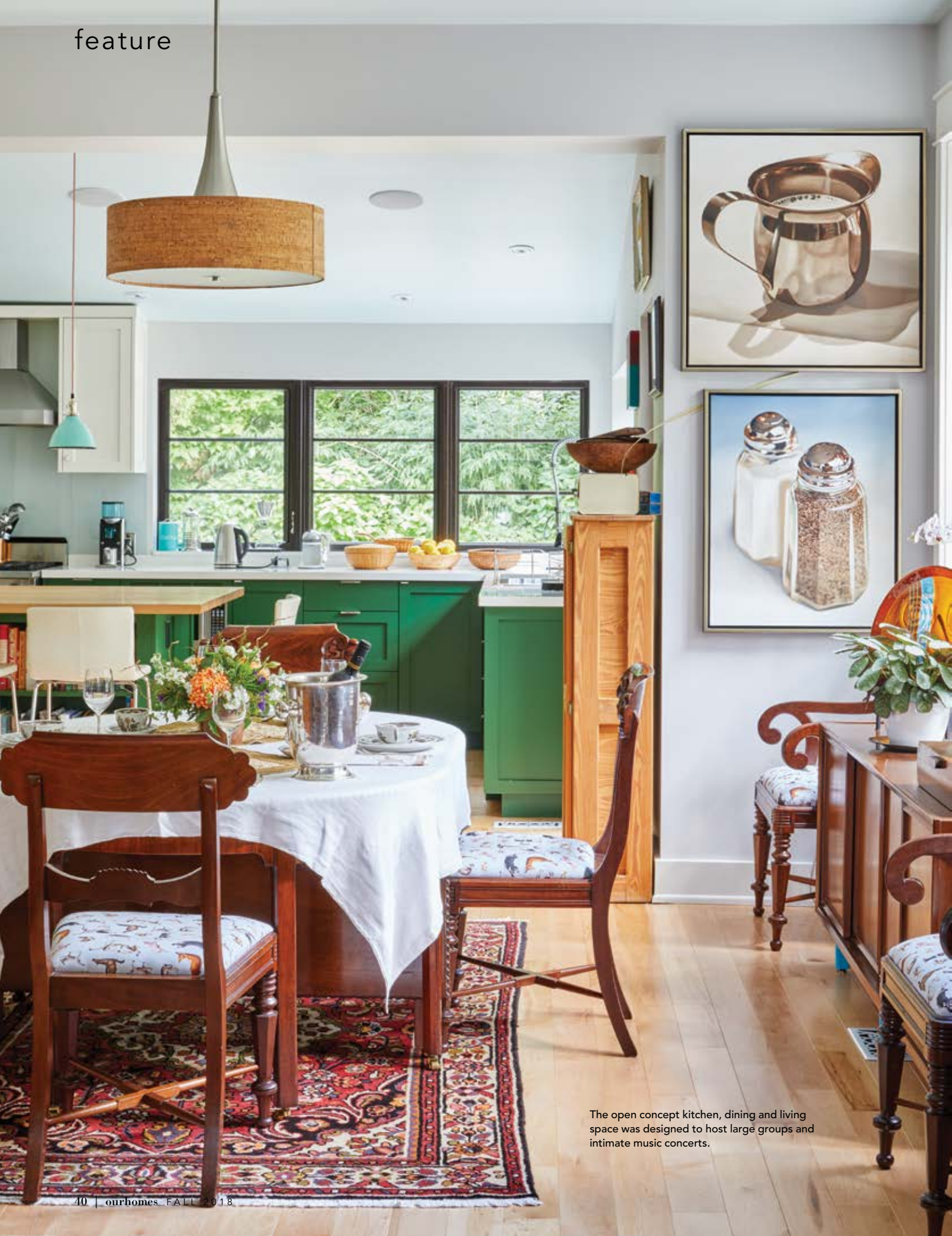
The open concept kitchen, dining and living space was designed to host large groups and intimate music concerts.